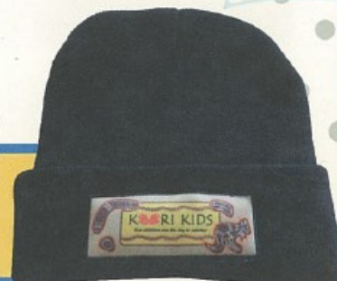
Beanie $ 3.50