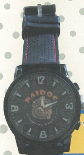
Wrist Watch $4.00