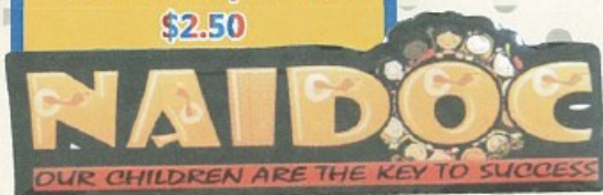
NAIDOC Lapel Pins $2.50