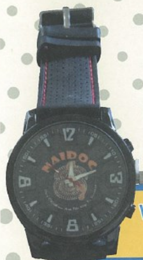
Wrist Watch $4.00