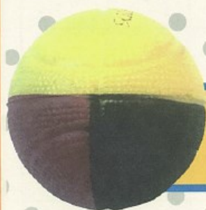
Mini Tennis Ball $2.50