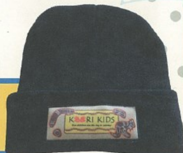
Beanie $ 3.50