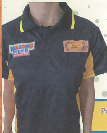
Polo Shirts $ 13.00