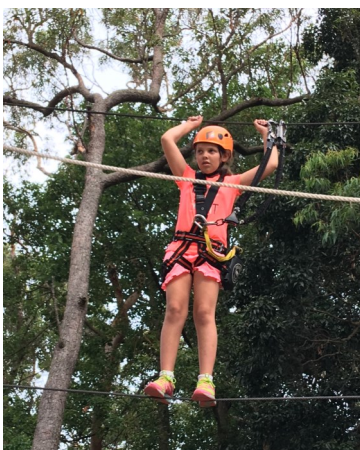
Stage 2 & 3 students enjoying camp activities.

All items of clothing, uniforms, bags and lunch boxes will be disposed of on Friday 15th December.